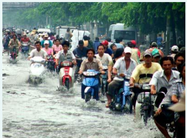
Figure 2: Urban flooding in HCMC

The model shall be used to estimate current and future flood damages and risk, taking both socio-economic developments and climate change into account. Moreover, it shall provide insights into the effectiveness of various adaptation strategies.